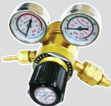
Stock No. 102052001C S$ 56.00

Leak proof, anti rust, easy to clean and read. Brass anodized solid Aluminium Alloy Finned body, baked paint Alloy die forged Zinc-Alloy Bonnet.