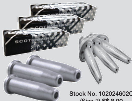
Stock No. 102024602C (Size 2) S$ 8.00

Oxy-CNG Nozzle Mix CNG-107 Cutting Nozzles are manufactured in two pieces of Brass Inner with splines and a hollow drawn copper outer sheath. The construction technology optimise a good balance Oxy-CNG mixed volume to achieve the usable heat for clean cut.