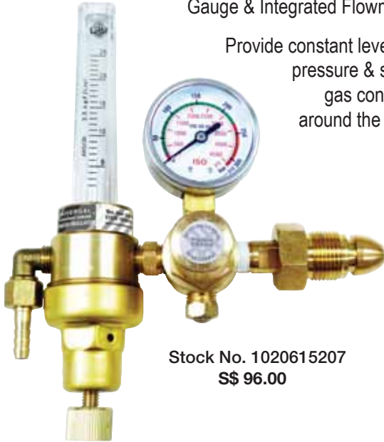
Stock No. 1020615207 S$ 96.00

Provide constant level gas pressure & stable gas condition around the weld.